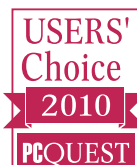
PCQuest Users' Choice