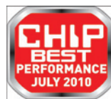
CHIP Best Performance UPS