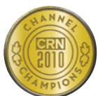
CRN Channel Champion Award